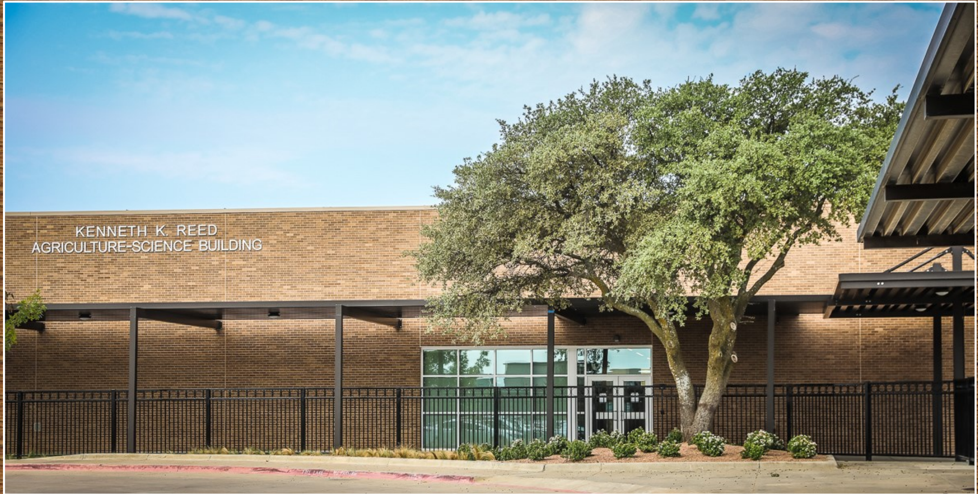
Landscaping complete on the Kenneth K. Reed Agriculture-Science Building