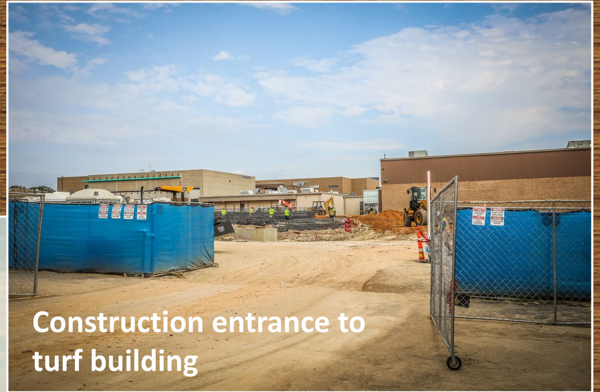
Construction entrance to turf building