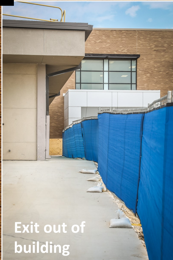
Exit out of building