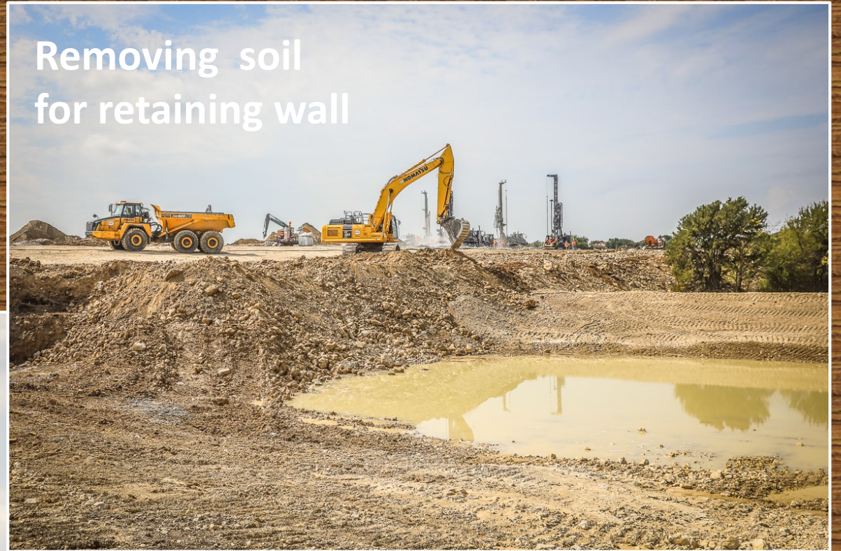
Removing soil for retaining wall