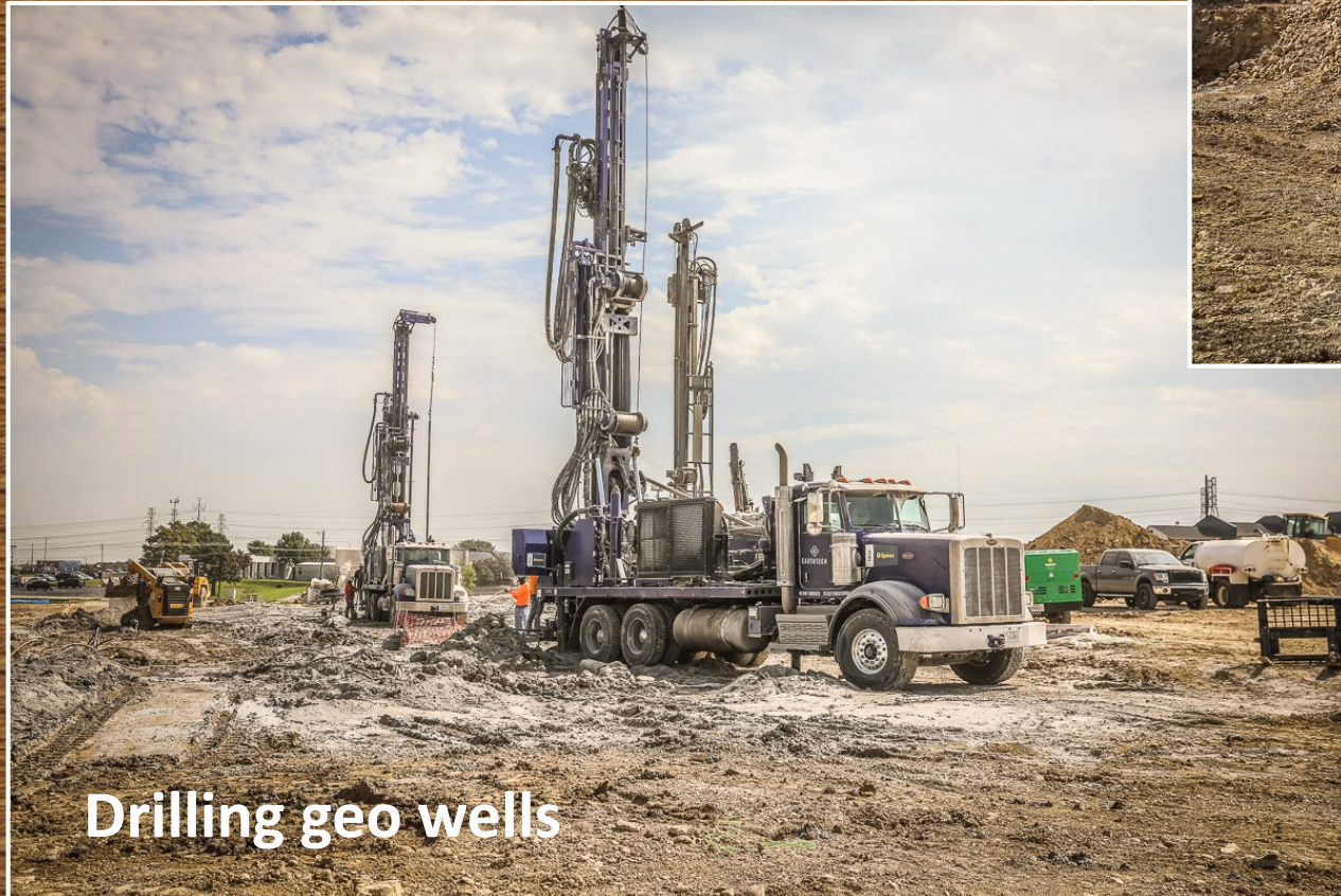
Drilling geo wells