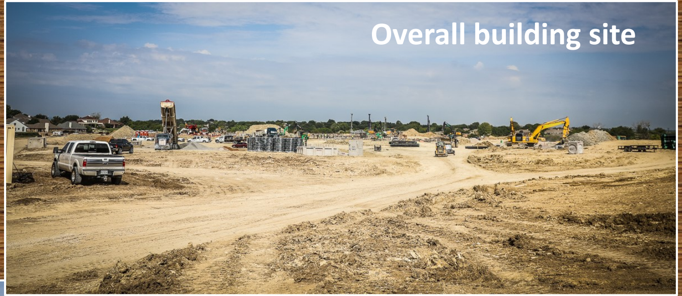
Overall building site